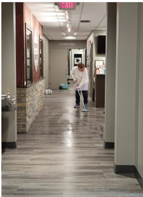
Group Employment participants keeping the DeKalb County History Center look shiny and new!