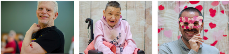
Clients enjoying Valentines Day activities

On Valentines Day, CDS celebrated with dancing, games, and a photo booth! Valentines Day is an exciting day for us at OH, and we are beyond grateful to spread the love during this beautiful holiday.