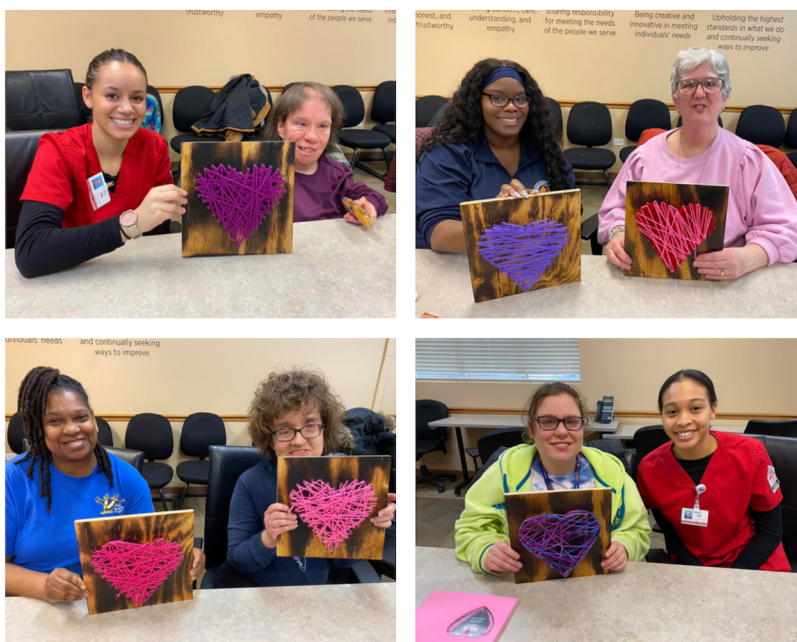
Individuals posing with their crafted hearts

Our Recivities are always exciting for the individuals we serve, whether it's an out and about activity, or staying in from the cold weather and enjoying a craft with friends. Crafts are always a big hit, and this time we had some visitors from the NIU School of Nursing!